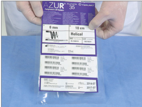
Confirm correct coil size

Before opening the packaging, confirm correct coil size. Also check the coil expiration date. Remove both AZUR® Peripheral Hydrocoil Embolization System introducer sheath and its stylet from the protective pouch.