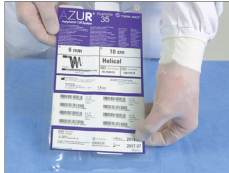
Check coil expiration date